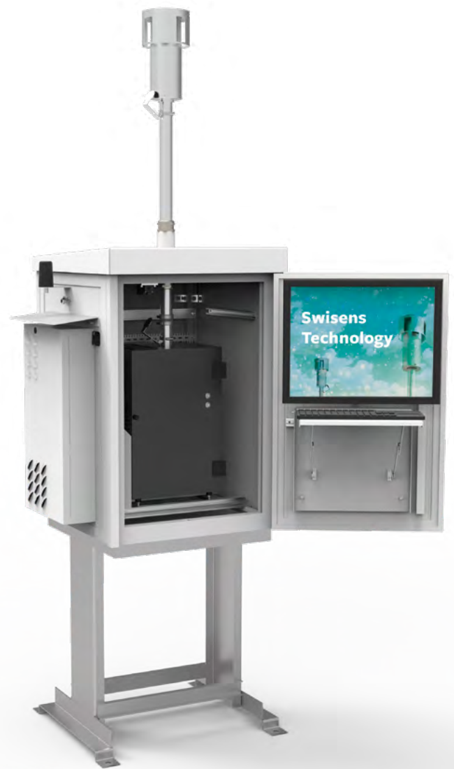
SwisensPoleno Jupiter as indoor application with SwisensAtomizer attached on the air inlet