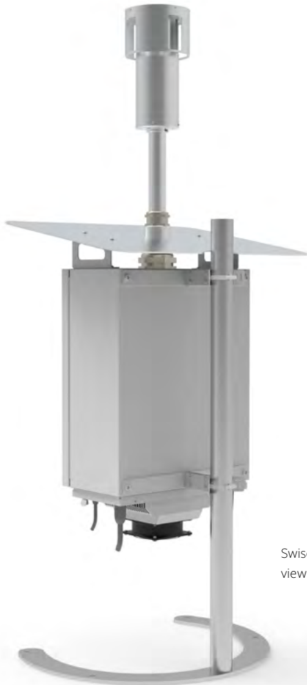
SwisensPoleno Mars rear view on post mount